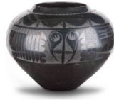
Title: Storage jar Date: c. 1940 Primary Maker: Maria Martinez Medium: Native-clay ceramic