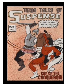
Title: Cry of the Conqueror, Tewa Tales of Suspense #14 Date: 2012 Primary Maker: Jason Garcia Medium: Native-clay ceramic and natural pigments