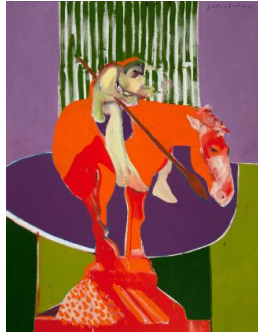
Title: The End of the Trail Date: 1970 Primary Maker: Fritz Scholder Medium: Oil on canvas