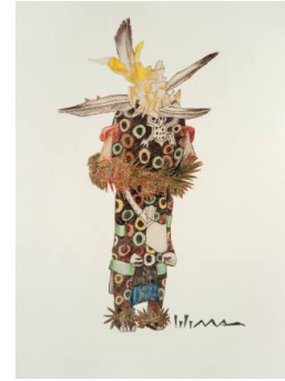
Title: Avach Hoya Kachina Date: 1988 Primary Maker: Charles Loloma Medium: Offset lithograph