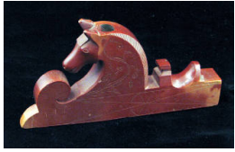
Title: Pipe bowl Date: c. 1870 Primary Maker: Unknown Medium: Catlinite