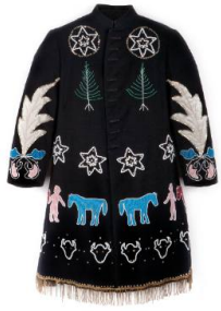
Title: Faw Faw coat Date: 1900-20 Primary Maker: Unknown Medium: Wool, glass beads, velvet, cotton cloth, metal fringe, and metal sequins