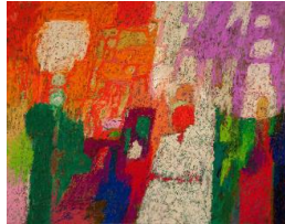
Title: Ex-Patriot Date: 1964 Primary Maker: George Morrison Medium: Oil on canvas