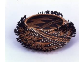
Title: Feathered bowl Date: c. 1877 Primary Maker: Unknown Medium: Willow, bulrush, fern, woodpecker feathers, quail feathers, shell beads, and glass beads