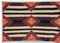
Title: Third Phase Chief Blanket Date: c. 1870 Primary Maker: Unknown Medium: Natural "churro" wool, indigo-dyed wool, and unraveled flannel