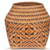
Title: Basket Date: c. 1941 Primary Maker: Nancy Bradley Medium: River cane and blood root and black walnut pigments