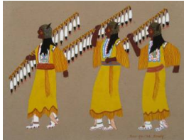
Title: Ceremonial Dance Date: 1930s Primary Maker: Lois Smoky (Bou-ge-tah) Medium: Watercolor on paper