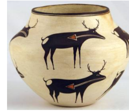
Title: Polychrome jar Date: 1959 Primary Maker: Lucy Martin Lewis Medium: Native-clay ceramic with slips