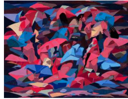
Title: Dance of the Heyoka Date: c. 1954 Primary Maker: Oscar Howe (Mazuha Hokshina) Medium: Casein-damar on watercolor paper