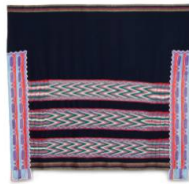
Title: Blanket Date: 1920-1930 Primary Maker: Unknown Medium: Broadcloth, wool yarn, silk ribbon, and glass beads