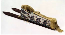
Title: Lattice cradle Date: c. 1895 Primary Maker: Unknown Medium: Wood, hide, glass beads, cotton, and brass tacks