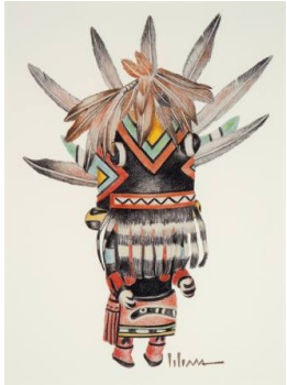
Title: Wuyak-Kuita Kachina Date: 1988 Primary Maker: Charles Loloma Medium: Offset lithograph