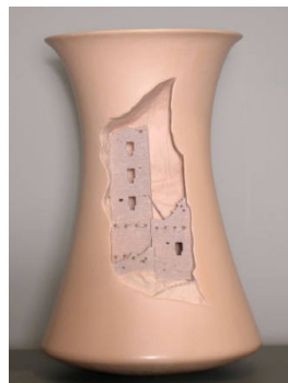
Title: Square Tower Date: 1998 Primary Maker: Al Qöyawayma Medium: Native-clay ceramic and wood