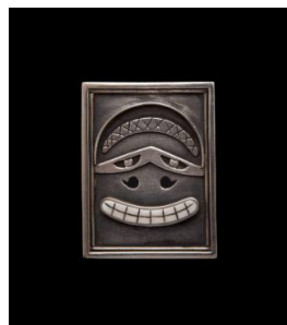
Title: Sea Mammal Mask Date: 1988 Primary Maker: Denise Wallace Medium: Sterling silver and fossilized ivory