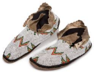
Title: Beaded moccasins (pair) Date: c. 1900 Primary Maker: Unknown Medium: Hide, glass beads, and sinew