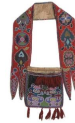
Title: Bandolier bag Date: c. 1870 Primary Maker: Unknown Medium: Wool, cotton, netting, hide, glass beads, wool yarn, and silk ribbon