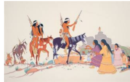
Title: Ill-Fated War Party's Return Date: c. 1950 Primary Maker: Allan Capron Houser Medium: Watercolor on paper, mounted on board