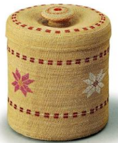
Title: Basket with lid Date: c. 1937 Primary Maker: Unknown Medium: Rye grass and silk thread