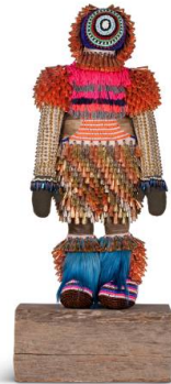
Title: Eternal Return Date: 2014 Primary Maker: Jeffrey Gibson Medium: Maple, wool, glass and plastic beads, acrylic yarn, deer rawhide, mohair, quartz crystals, tin and copper jingles, steel and brass studs, artificial sinew, nylon thread, metal wire, steel rods, and found railroad tie (pine)