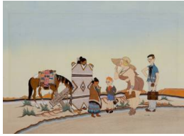
Title: Land of Enchantment Date: c. 1946 Primary Maker: Woodrow Wilson Crumbo Medium: Watercolor on board