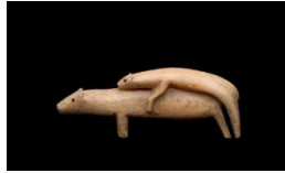
Title: Carved polar bear figures Date: c. 1900 Primary Maker: Unknown Medium: Walrus ivory