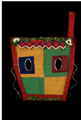
Title: Horse mask Date: 1890-1910 Primary Maker: Unknown Medium: Buffalo hide, glass beads, broadcloth, silk ribbon, and brass bells