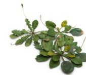
Title: Untitled (Abandon 68-08) Date: 2008 Primary Maker: Tony Matelli Medium: Bronze and vinyl paint