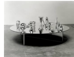
Title: Landscape Model for Total Reflective Abstraction (V) Date: 2004 Primary Maker: Josiah McElheny Medium: Mirrored glass table with hand blown mirrored glass objects