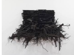
Title: Number 148 Date: 2010 Primary Maker: Leonardo Drew Medium: Painted wood with strings, screws, and metal