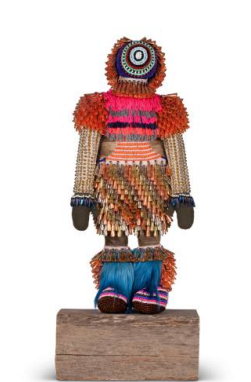
Title: Eternal Return Date: 2014 Primary Maker: Jeffrey Gibson Medium: Maple, wool, glass and plastic beads, acrylic yarn, deer rawhide, mohair, quartz crystals, tin and copper jingles, steel and brass studs, artificial sinew, nylon thread, metal wire, steel rods, and found railroad tie (pine)