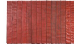
Title: Reflections on El Lissitzky Date: 2013 Primary Maker: Theaster Gates Medium: Decommissioned fire hose and wood