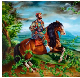
Title: Equestrian Portrait of Philip IV