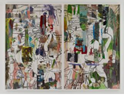
Title: Door Date: 2009 Primary Maker: Arturo Herrera Medium: Mixed media