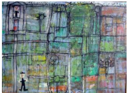
Title: Nurseryman (Pépinieriste) Date: 1944 Primary Maker: Jean Dubuffet Medium: Oil on canvas