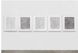
Title: Untitled (Nets) Date: 2002 Primary Maker: Rachel Whiteread Medium: German silver sheet metal gratings mounted to white museum board mats, ed.