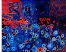
Title: Zuma Date: 1965 Primary Maker: Lee Mullican Medium: Oil on canvas