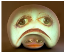
Title: Swathe Date: 2004 Primary Maker: Tony Oursler Medium: Fiberglass sculpture, two DVDs, projector, and DVD player