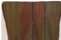
Title: Beth Nun Date: 1958 Primary Maker: Morris Louis Medium: Acrylic stain on raw canvas