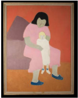
Title: Child with Doll Date: 1944 Primary Maker: Milton Avery Medium: Oil on canvas