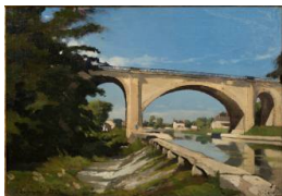
Title: The Railway Bridge at Briare (Le pont du chemin de fer à Briare) Date: 1888 Primary Maker: Henri-Joseph Harpignies Medium: Oil on canvas