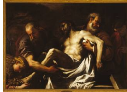
Title: Entombment of Christ Date: c. 1655 Primary Maker: Luca Giordano Medium: Oil on canvas