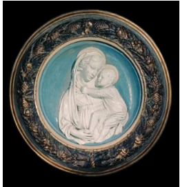
Title: Madonna and Child Date: c. 1450 Primary Maker: Workshop of Luca della Robbia Medium: Glazed terracotta