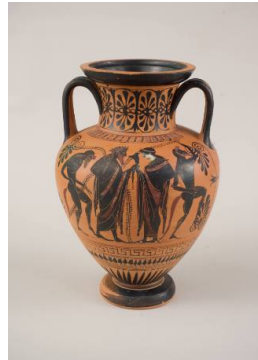
Title: Amphora with Heracles and Dionysus Date: c. 530-520 BCE Primary Maker: the Euphiletos Painter Medium: Terracotta