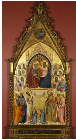
Title: The Coronation of the Virgin Date: c. 1375 Primary Maker: Circle of Orcagna (Andrea di Cione) Medium: Tempera and gold on wood panel