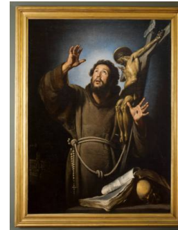
Title: Saint Francis in Ecstasy Date: c. 1635-37 Primary Maker: Bernardo Strozzi Medium: Oil on canvas