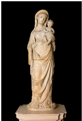
Title: Madonna and Child Date: 1525 Primary Maker: Unknown Medium: Terracotta with traces of polychrome