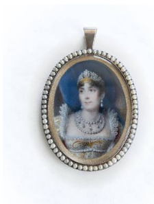
Title: Portrait of Empress Joséphine de Beauharnais Date: c. 1809 Primary Maker: Jean-Baptiste Isabey Medium: Watercolor on ivory mounted under glass with a pearl border in a copper alloy pendant case