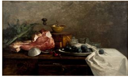
Title: Still Life with Coffee Mill Date: c. 1856 Primary Maker: Eugène Boudin Medium: Oil on canvas