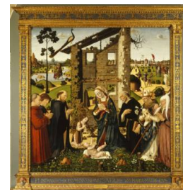
Title: The Adoration of the Child with Saints and Donors Date: c. 1476 Primary Maker: Biagio d'Antonio Medium: Tempera on wood panel