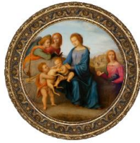
Title: Madonna and Child with Saints and Angels Date: c. 1515-18 Primary Maker: Piero di Cosimo Medium: Oil on wood panel