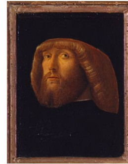
Title: A Bearded Man Date: c. 1485 Primary Maker: Giovanni Bellini Medium: Tempera on wood panel