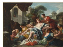
Title: Bathsheba at Her Toilette Date: c. 1750 Primary Maker: Jean François de Troy Medium: Oil on canvas