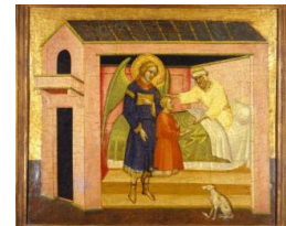
Title: Tobit Blessing His Son, Tobias, Accompanied by Archangel Raphael Date: c. 1405-10 Primary Maker: Jacobello del Fiore Medium: Tempera and gold on linden wood panel