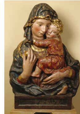
Title: Madonna and Child Date: c. 1400-1430 Primary Maker: Unknown Medium: Terracotta and polychrome