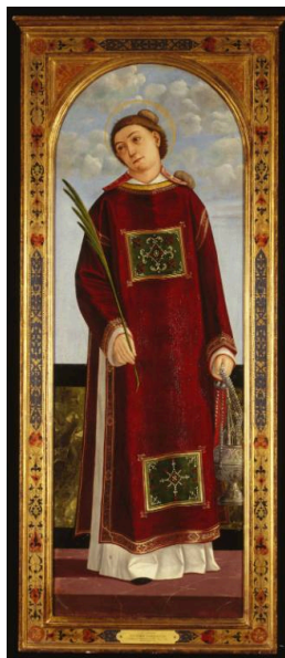
Title: Saint Stephen Date: c. 1505-14 Primary Maker: Vittore Carpaccio Medium: Oil on wood panel