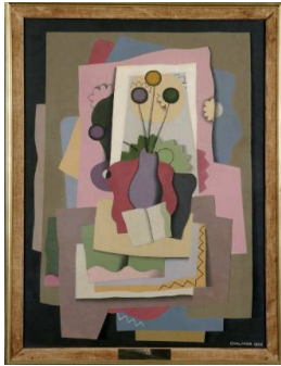
Title: Cubist Still Life Date: 1926 Primary Maker: Georges Valmier Medium: Oil on canvas