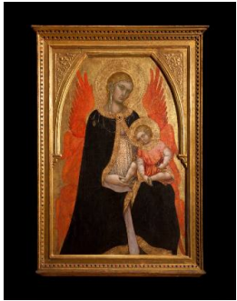
Title: Madonna and Child Date: c. 1410 Primary Maker: Taddeo di Bartolo Medium: Tempera and gold on wood panel