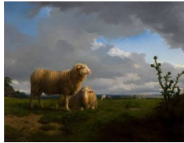
Title: Meadow and Sheep Date: 1891 Primary Maker: Rosa Bonheur Medium: Oil on canvas