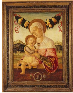
Title: Madonna and Child Date: c. 1470 Primary Maker: Circle of Andrea Mantegna Medium: Tempera on wood panel