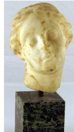
Title: Female head Date: Late fourth to third century BCE Primary Maker: Unknown Medium: Marble