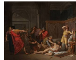
Title: The Death of Cato Date: 1797 Primary Maker: Mathieu Ignace Van Brée Medium: Oil on canvas