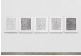
Title: Untitled (Nets) Date: 2002 Primary Maker: Rachel Whiteread Medium: German silver sheet metal gratings mounted to white museum board mats, ed.