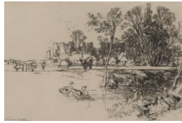
Title: Cowdray Castle, with Geese Date: 1882 Primary Maker: Seymour Haden Medium: Etching with drypoint