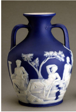
Title: Portland Vase Date: 19th century Primary Maker: Wedgwood Medium: Jasperware