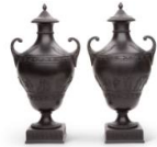
Title: Pair of lidded urns Date: second half 18th century Primary Maker: Wedgwood Medium: Black basalt