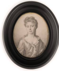
Title: Portrait of a Woman Date: 1705 Primary Maker: Thomas Forster Medium: Graphite on vellum