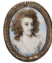
Title: Portrait of a Woman Date: c. 1785-90 Primary Maker: George Engleheart Medium: Watercolor on ivory mounted under glass with a braided hair border set into a partial metal case