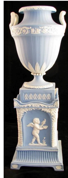
Title: Pair of urns with pedestals Date: 1825 Primary Maker: Wedgwood Medium: Jasperware