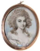
Title: Portrait of a Woman Date: c. 1785 Primary Maker: George Engleheart Medium: Watercolor on ivory mounted under glass in a gold case; decorative element comprised of mother of pearl, hair, pearls, and gold on a foil base inset into reverse, fully visible and mounted under glass