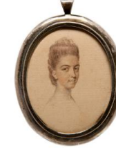
Title: Portrait of a Woman Date: c. 1775 Primary Maker: John Smart, I Medium: Watercolor and pencil on laid paper mounted under glass in a silver gilt pendant case